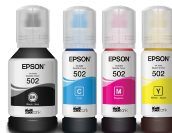
Replacement ink bottles

Designed for Reliability — Worry-free 2-year limited warranty with registration 8 , including full unit replacement