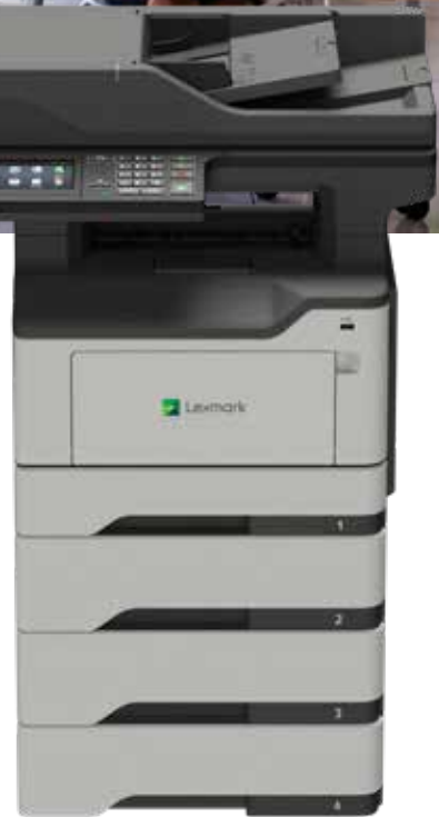
MX522adhe with optional trays